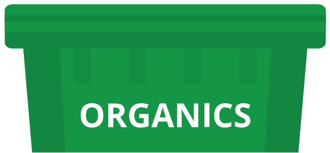
The donut, leaves, carrot, chicken leg and the wishbone all go into the green cart!

RecycleSmart Central Contra Costa Solid Waste Authority 1850 Mt. Diablo Blvd., Ste. 320 Walnut Creek, CA 94596