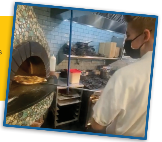
Take a slice out of food waste